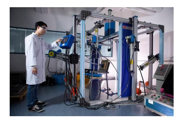
Physical and Mechanical Testing