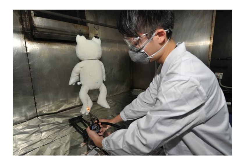
Toys and Children's Products Testing